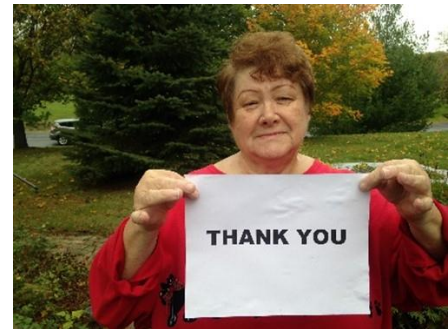
Client holding Thank You sign

Please send your photos, the names of the individuals in the photos, and the scanned photo consent forms to Info@Eras.org by November 1, 2021. Thank you for helping us capture more moments of your work in action!