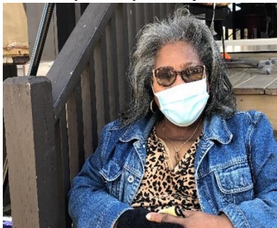
Client looking at camera

Other examples of photos you could take: