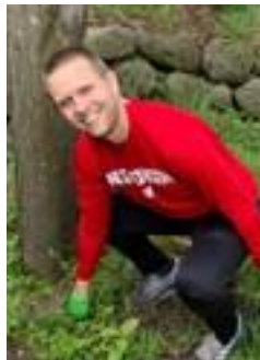
Volunteer looking at camera