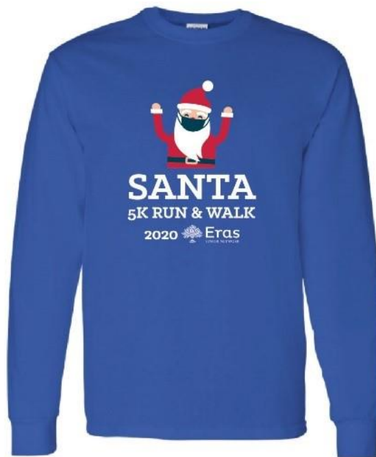
2020 winning logo and shirt color

Registered participants can choose between an adult-sized or child-sized long-sleeved t-shirt OR an adult-sized crewneck sweatshirt.